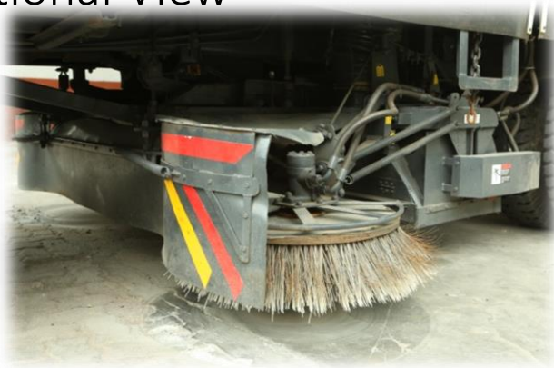
Main Broom & Vacuum area